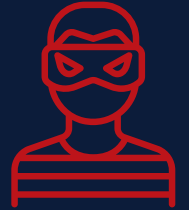
State Sponsored Threats