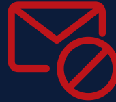
SPAM & Spoofing